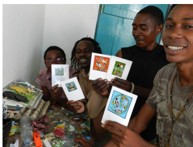
the painters prep an order –