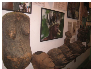
our musum gets a facelift